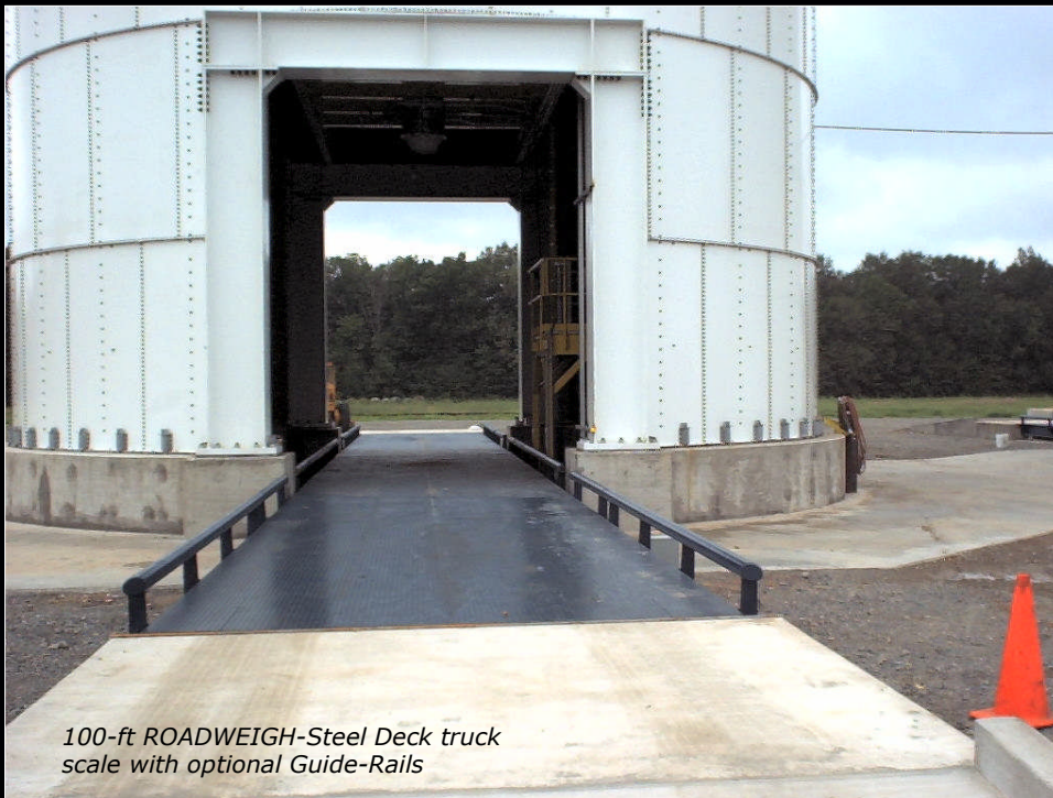
100-ft ROADWEIGH-Steel Deck truck scale with optional Guide-Rails

Hydrostatic weighing systems give you the piece of mind that each and every day your scale will be operating and monitoring your in-process cash flow. The load cells on these Hydrostatic truck scales are IMMUNE to lightning and water damage, so when you have a truck load that costs thousands of dollars per weighing cycle, why would you even think about trusting the "low-bid" product. Get a scale that will last you for decades.