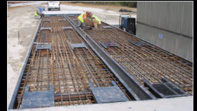
After construction, before concrete