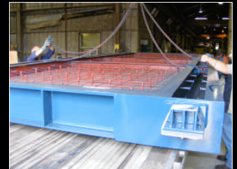
Weighbridge without concrete